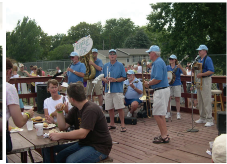
Blue Ox Jazz Babies Band entertained us as we enjoyed the Dog Pound! Notice that the Tuba player is someone we know very well. (Hint, he will be featured in our next newsletter.)