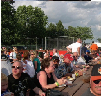
A row of AFI employees enjoying the food and fun.. Take a look at the clouds in the sky.